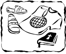
Rocky Mountain High Trip

Please keep our youth group in your prayers as we prepare for an exciting and faith-filled week at Rocky Mountain High.